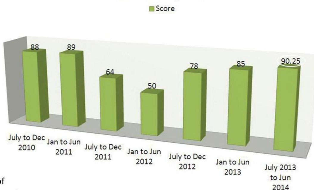
QEC GROWTH SCALE

QEC at IU scored 85 for the period January to June 2014 and this leads the department in the "W" category. We firmly believe that this would not have been possible without the support of management, faculty and students who cooperated with us at every crucial stage. Moreover, we hope to deliver much better results in the future and assure our stakeholders for continuous improvement of quality education at Indus University.